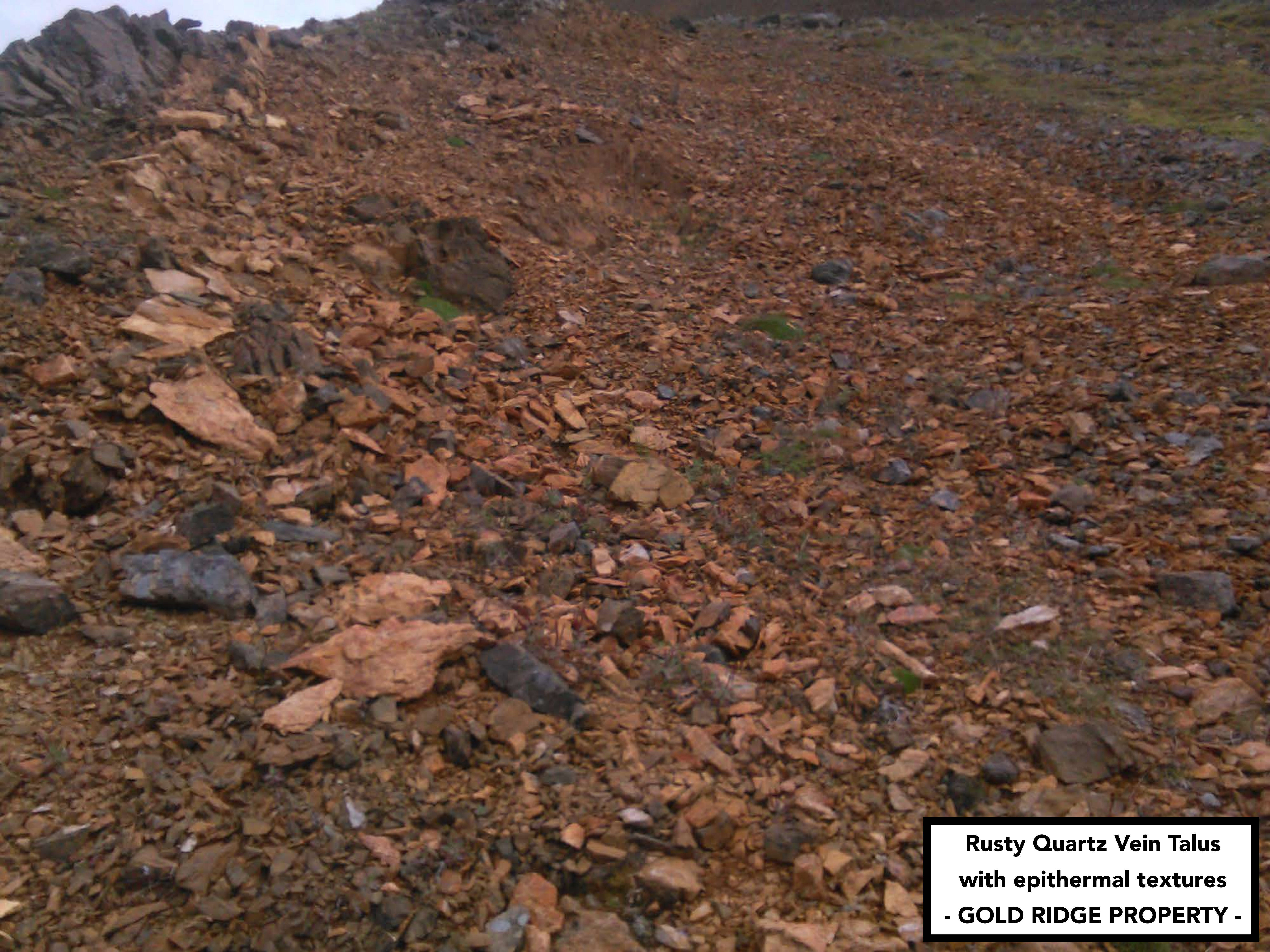
Rusty Quartz Vein Talus with epithermal textures - GOLD RIDGE PROPERTY -