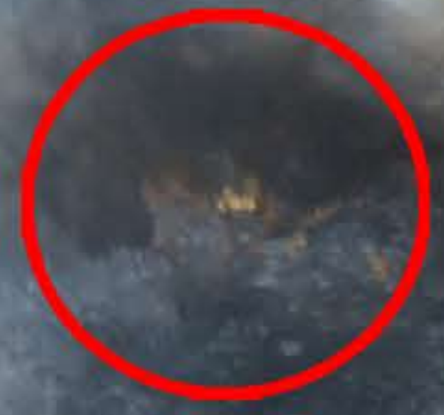
Visible Gold Solomon Trend - VG Zone