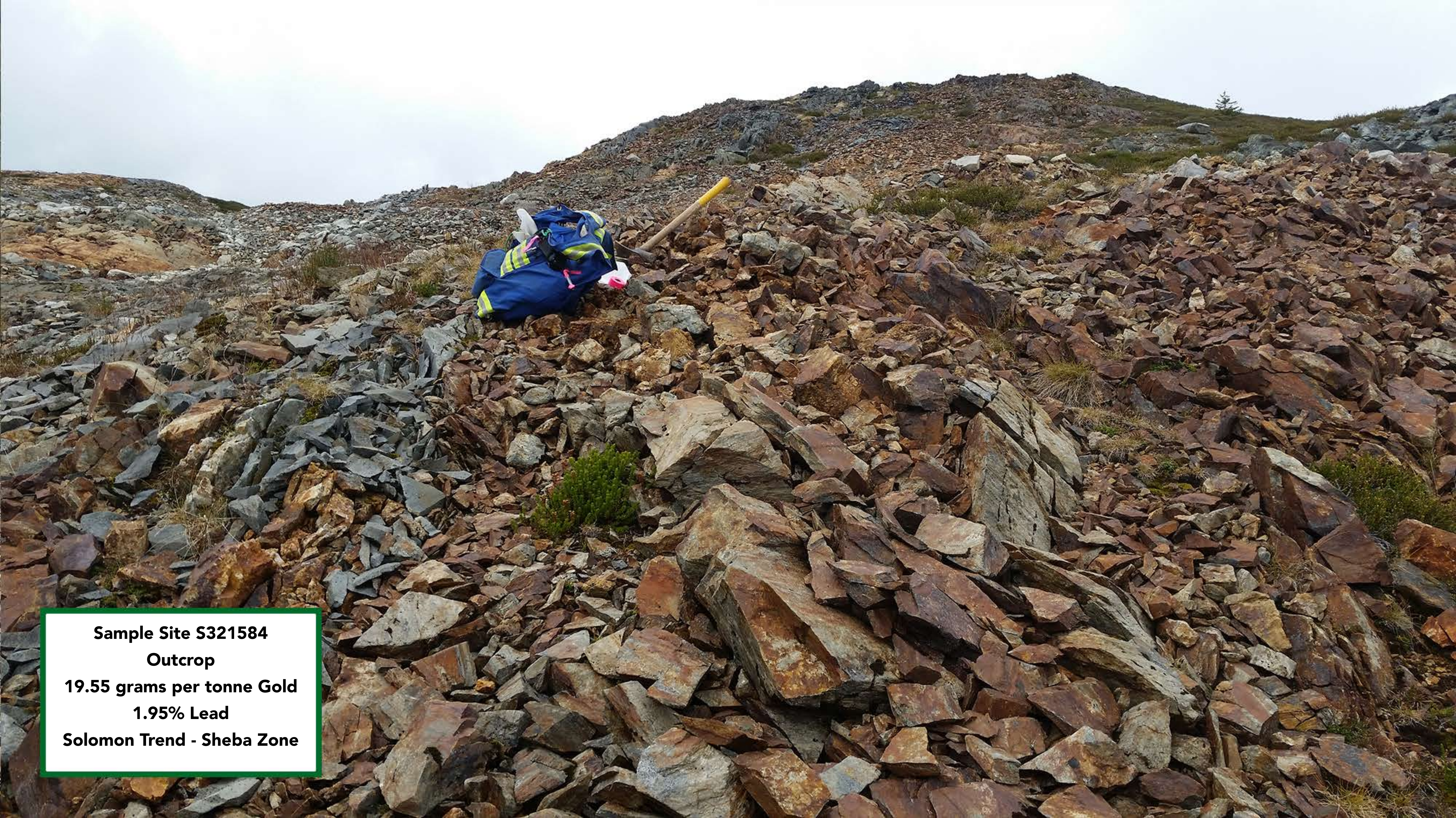
Sample Site S321584 Outcrop 19.55 grams per tonne Gold 1.95% Lead Solomon Trend - Sheba Zone