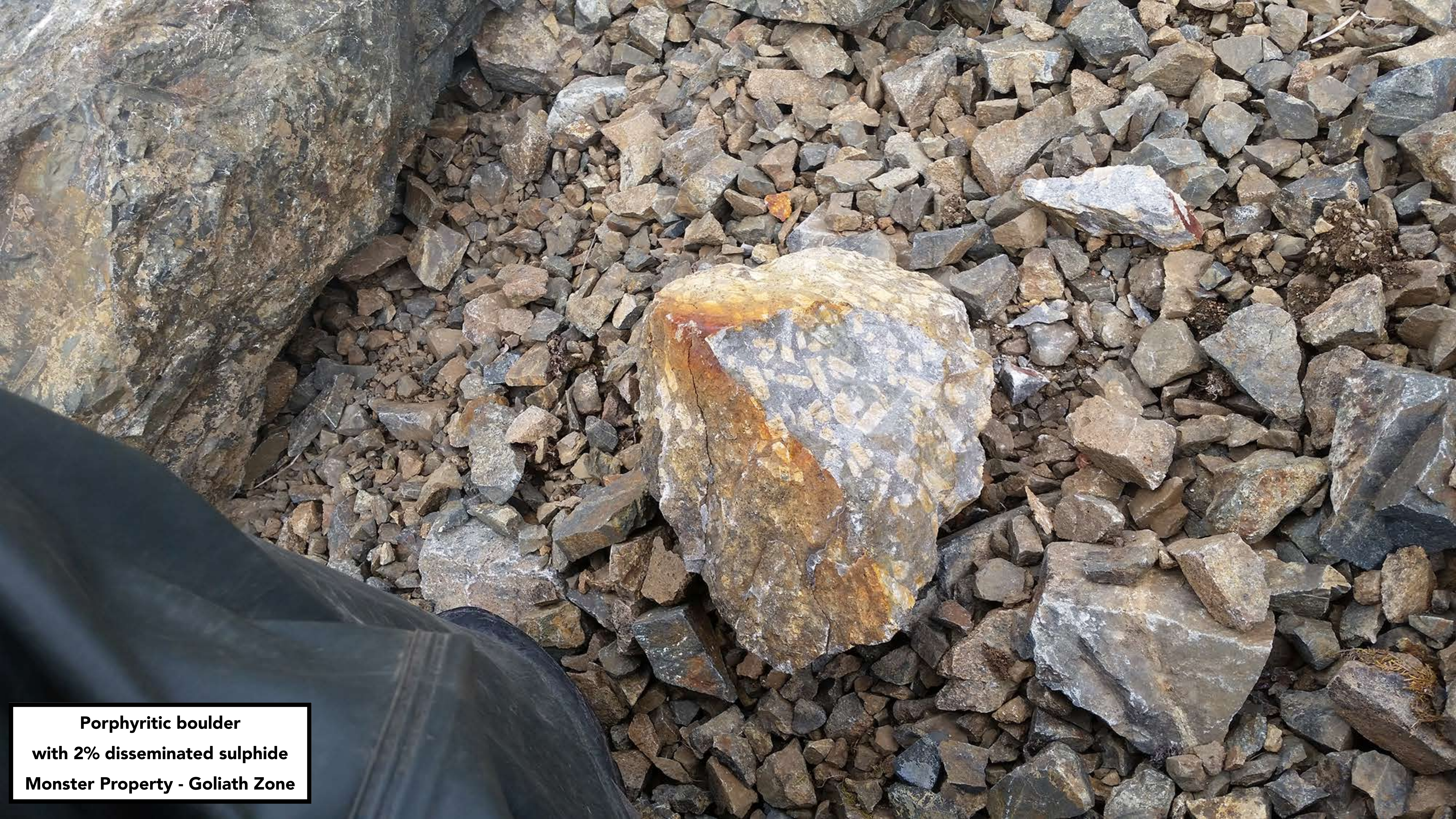
Porphyritic boulder with 2% disseminated sulphide Monster Property - Goliath Zone