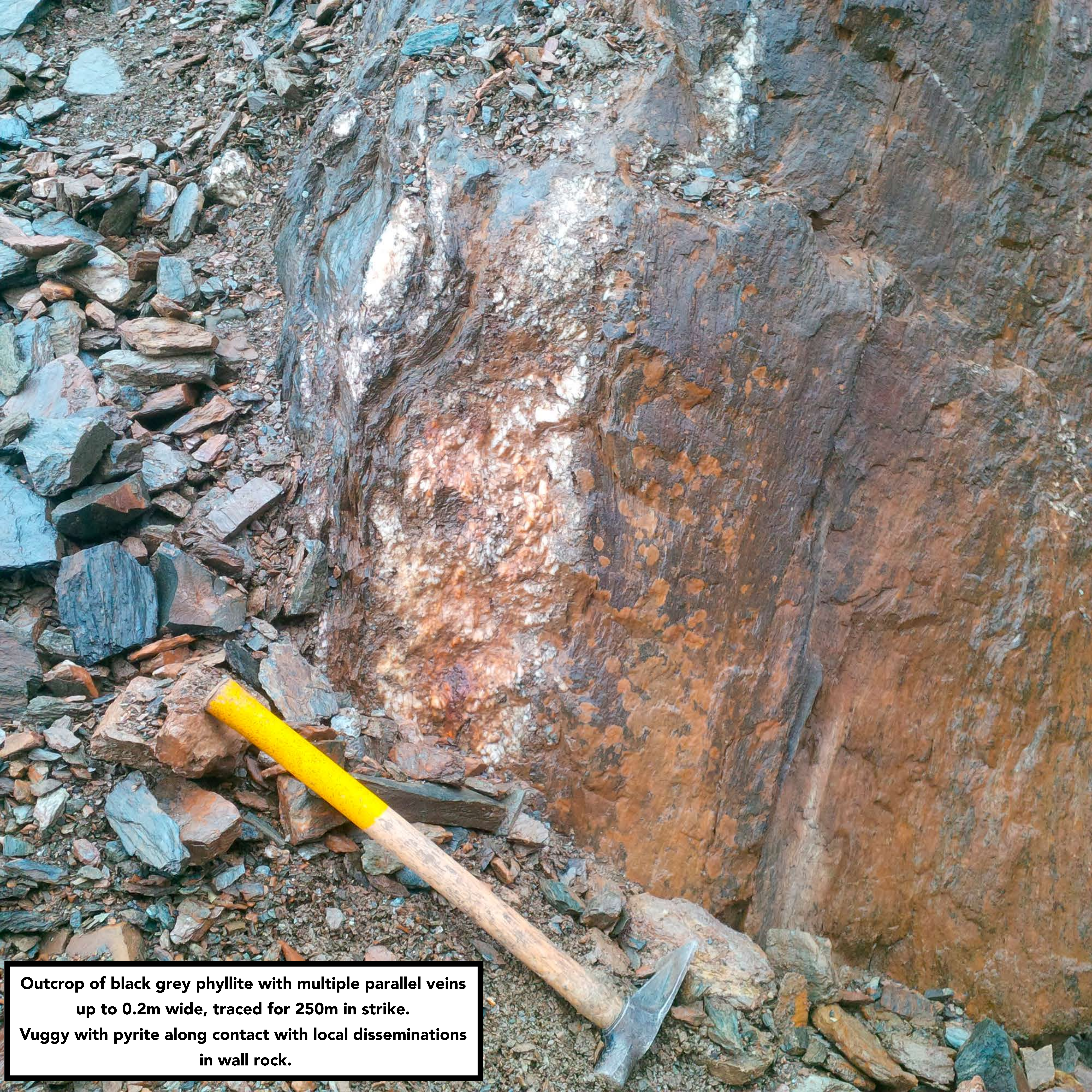
Outcrop of black grey phyllite with multiple parallel veins up to 0.2m wide, traced for 250m in strike. Vuggy with pyrite along contact with local disseminations in wall rock.