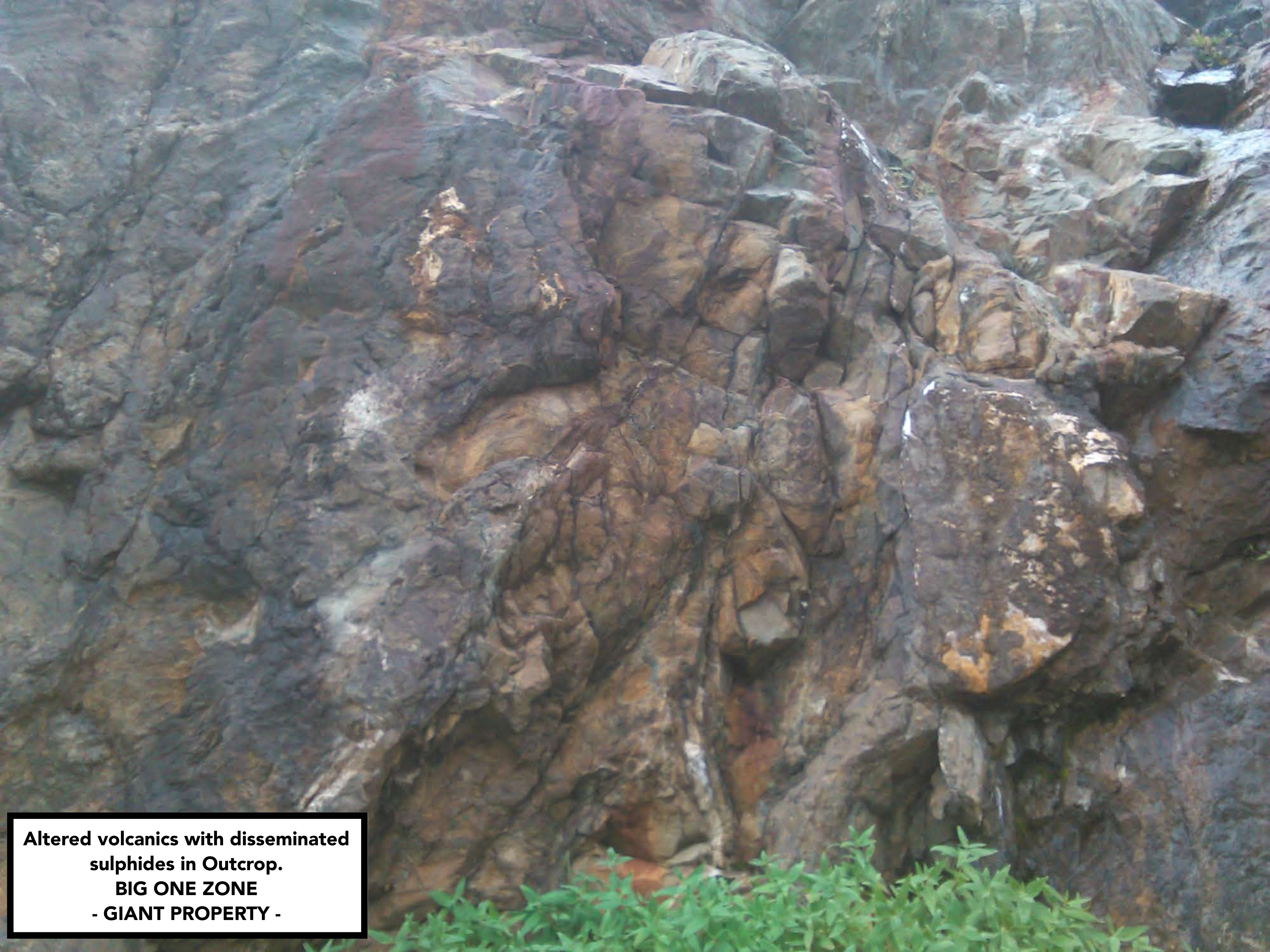
Altered volcanics with disseminated sulphides in Outcrop. BIG ONE ZONE - GIANT PROPERTY -