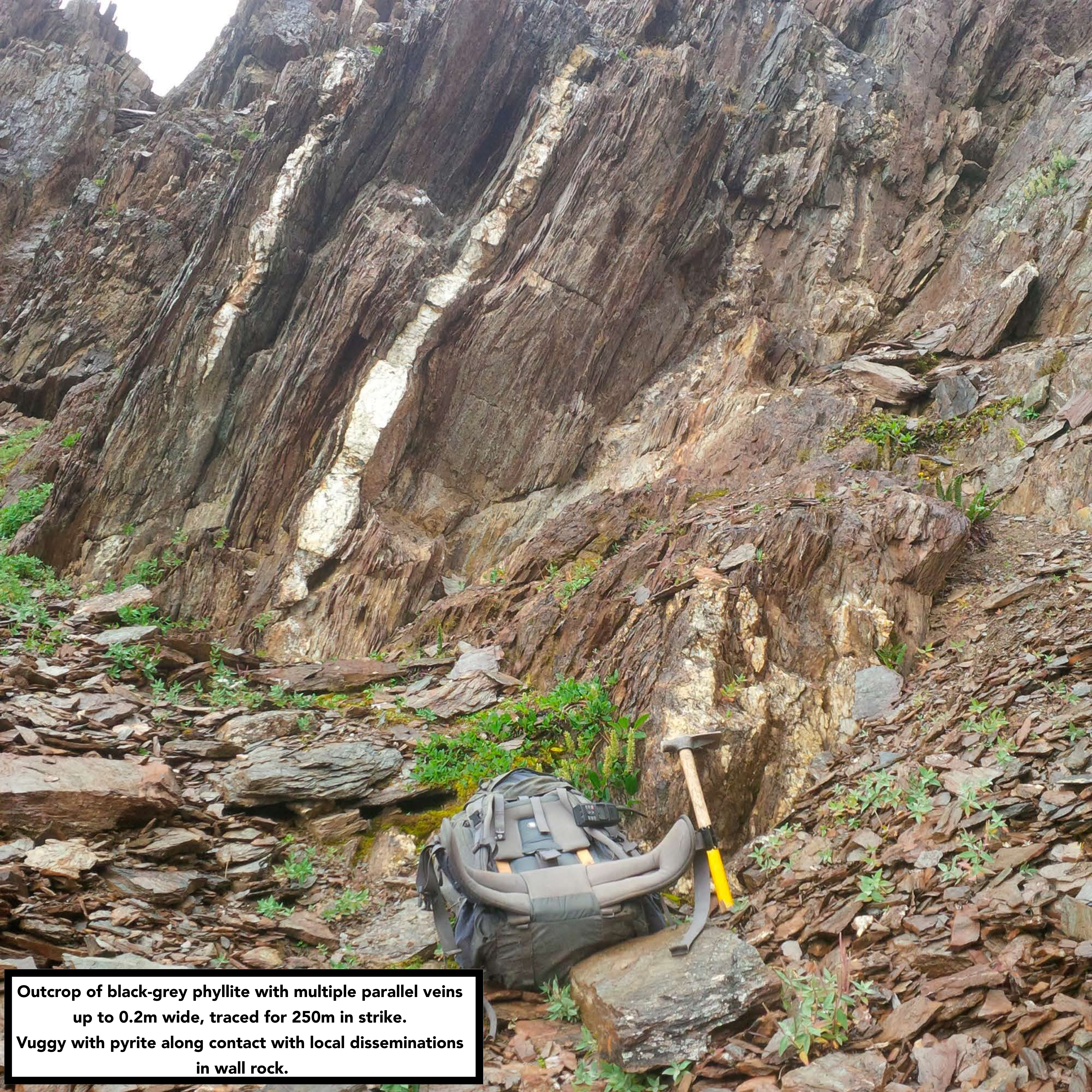
Outcrop of black-grey phyllite with multiple parallel veins up to 0.2m wide, traced for 250m in strike. Vuggy with pyrite along contact with local disseminations in wall rock.